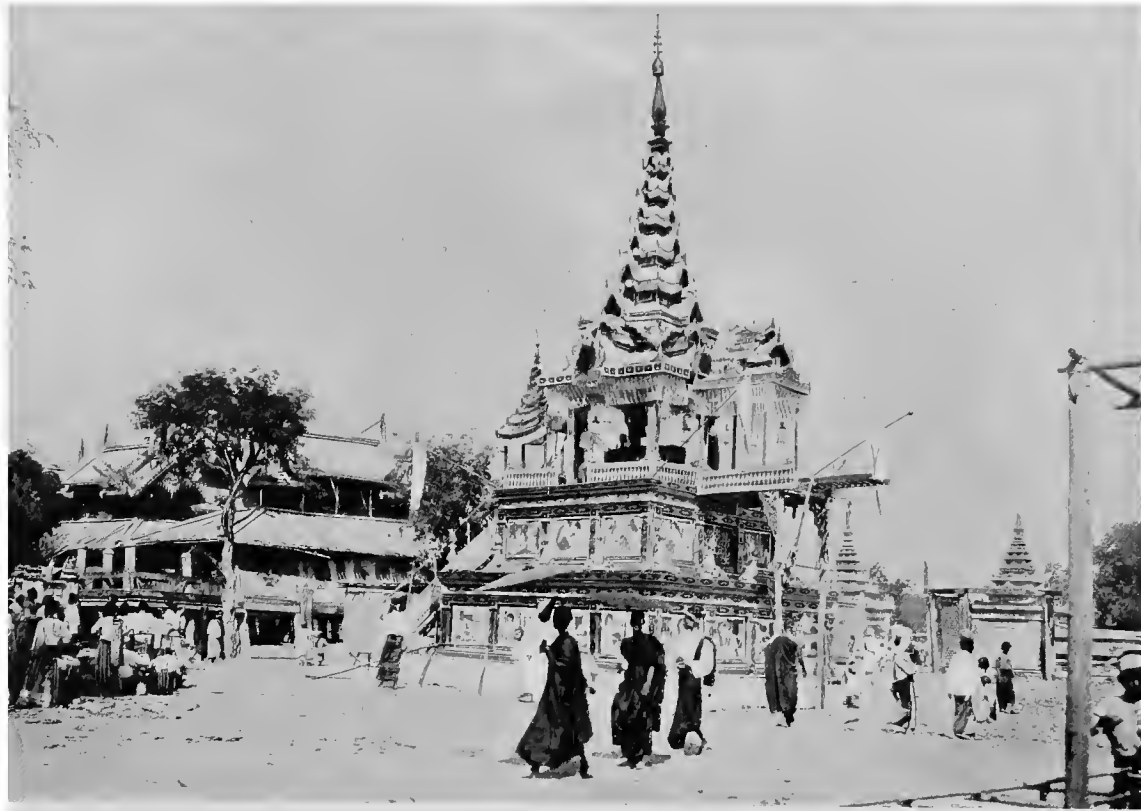
A Pongeebyan, or Funeral of a Burmese Priest